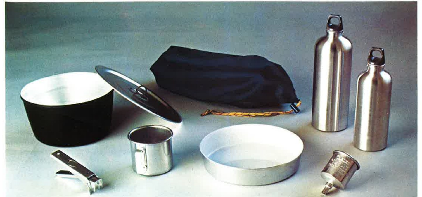
Cookware and accessories to accompany the MSR Stove System

The fast cooking time makes for higher fuel efficiency because there is less time for heat loss. A quart fuel bottle of white gas can boil 48 quarts of water or melt snow to 48 quarts of water. This means you may carry less fuel!