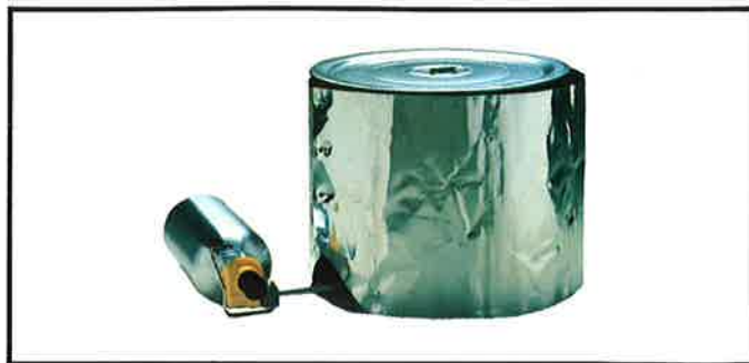
MSR Stove with windscreen in place

This long list of features has made these stoves a top choice for mountaineers, backpackers, boaters, bicyclists, and campers. #22-101, Model G, 15 oz. #22-102, Model GK, 16 oz.